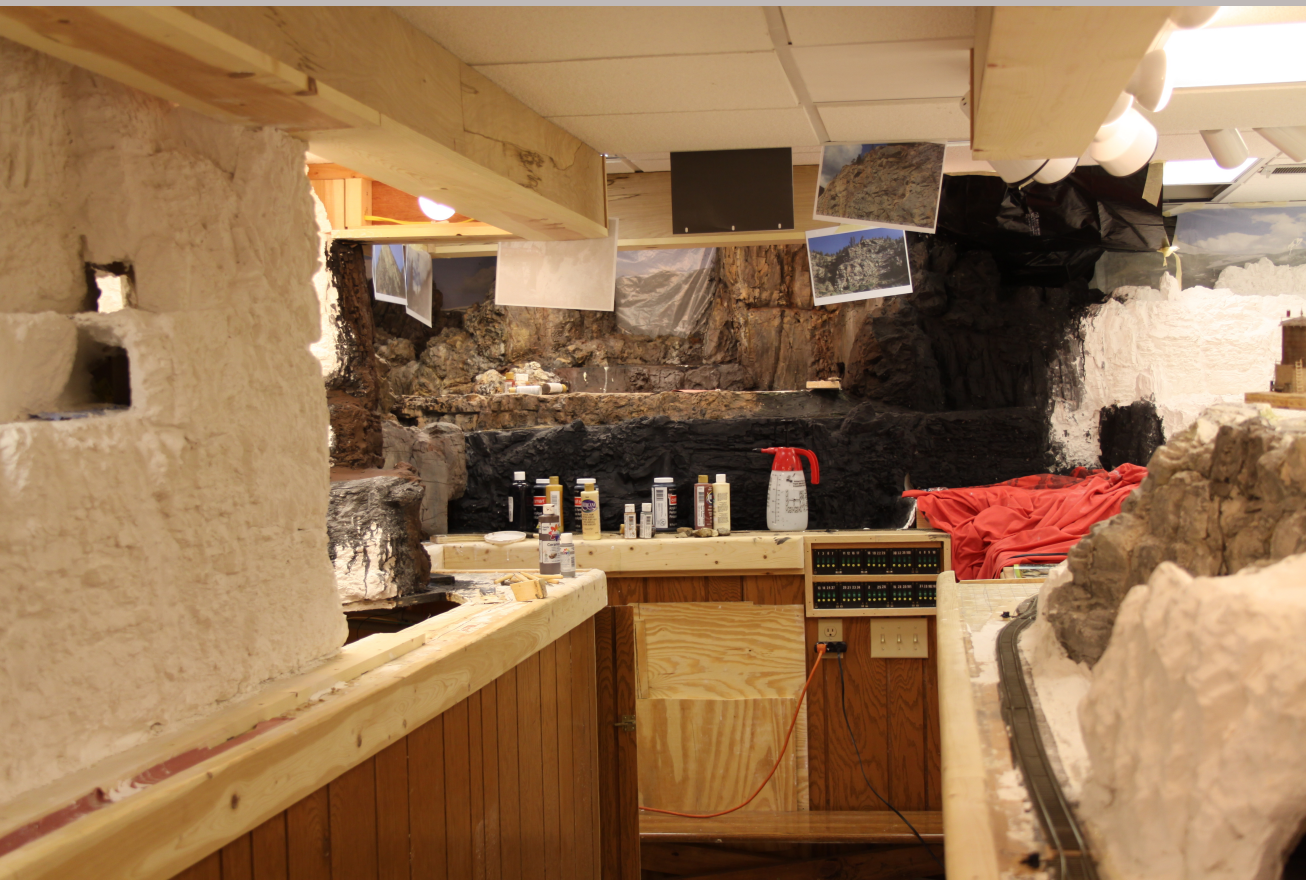
A flashback to June of 2011. A little progress in the past 11 years.